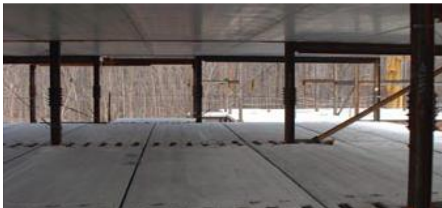
Unobstructed ceilings with Girder-Slab system.