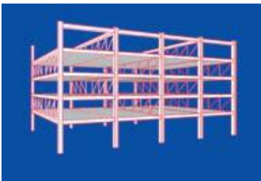
Schematic view of the staggered truss framing system.

Room layout and spacing often dictates which type of floor slab to use. A main consideration is whether to have the slab span from demising wall to demising wall or from perimeter to corridor. Spanning from perimeter to corridor creates a very flex-