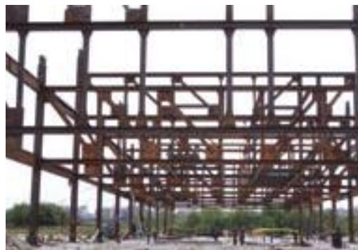
Column-free lower level.